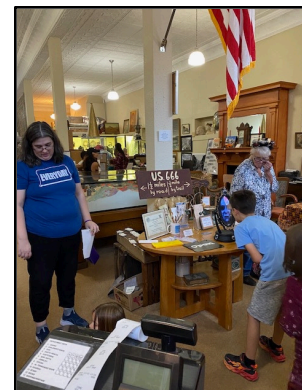
2023 Halloween Scavenger Hunt