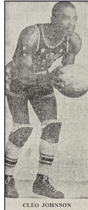
Feb. 13, 1948 Copper Era (Clifton, AZ) newspaper.