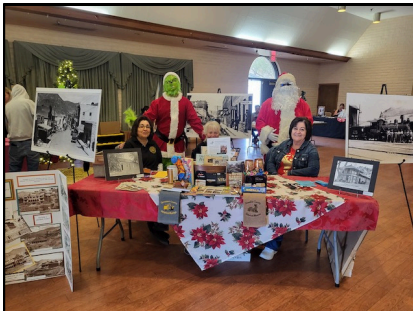
2023 Gift Basket Raffle

Recovering from the challenges of the COVID shutdown has been a tough journey. However, through perseverance, determination, and the backing of our Board of Directors, we successfully introduced the following programs and activities: