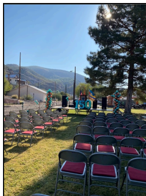
Town of Clifton Founders Day Celebration